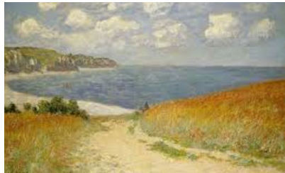
Monet - Beach paintings